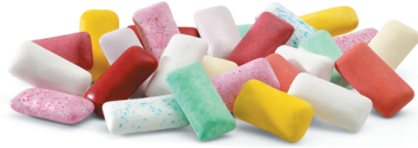
chewing gum ['tʃu:ɪŋ ,ɡʌm]